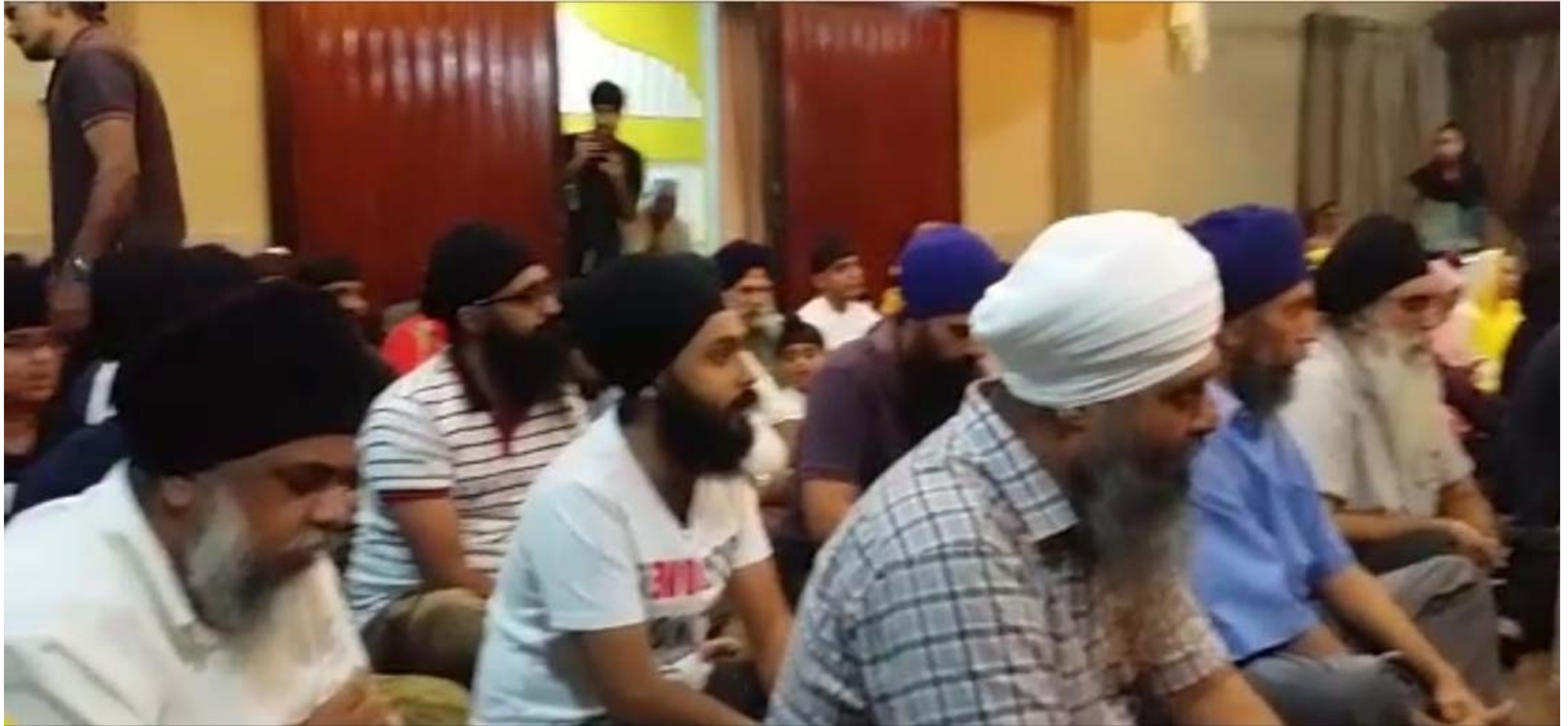
Photograph showing Sangat present at Gurdwara Sahib Greentown (Ashby Road) on 1 st March 2017